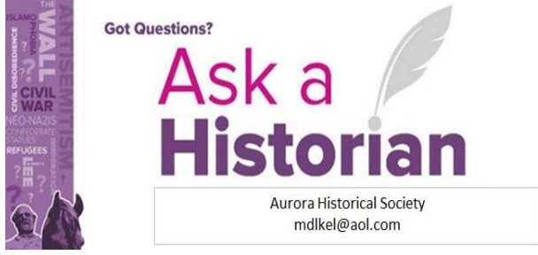
Aurora's Historic Newspaper Digitization Project

One Professional Team Delivering Quality Solutions to Every Customer Our Values in Action Teamwork •Excellence • Accountability • Safety • Integrity • Communication