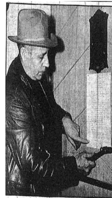
Trouble with the Law