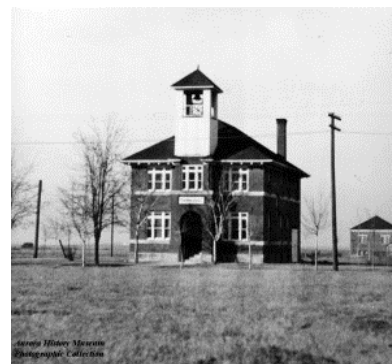
Town Hall circa 1906