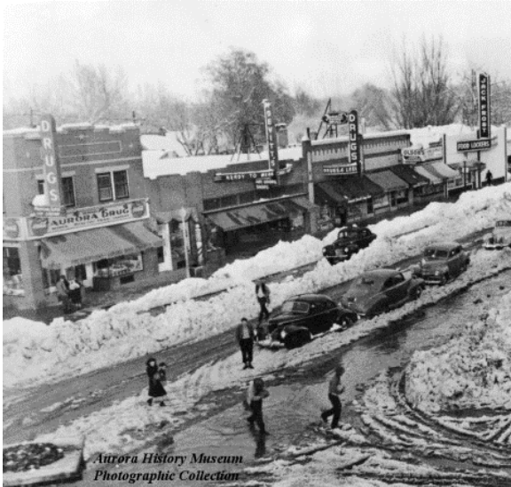
Colfax circa 1950