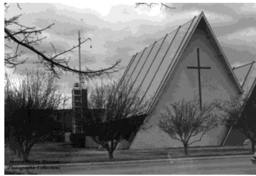
First Presbyterian Church, 1580 Kingston, south view of church churches for themselves.

The Aurora Community Presbyterian Church was a church home for many people of many denominations for many states of the United States. In the early forties and through the fifties, the town grew rapidly. In 1940, the population was 3,000; in 1950, 11,000; and in 1953, 19,000. Future growth could not be predicted, but the foresight which the officers of the church had held true. The different denominations began to pull away and build new